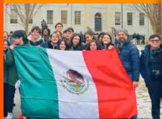
Viaje a Boston